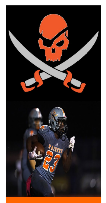
ORANGE PARK HIGH SCHOOL 2300 Kingsley Ave Orange Park, FL 32073